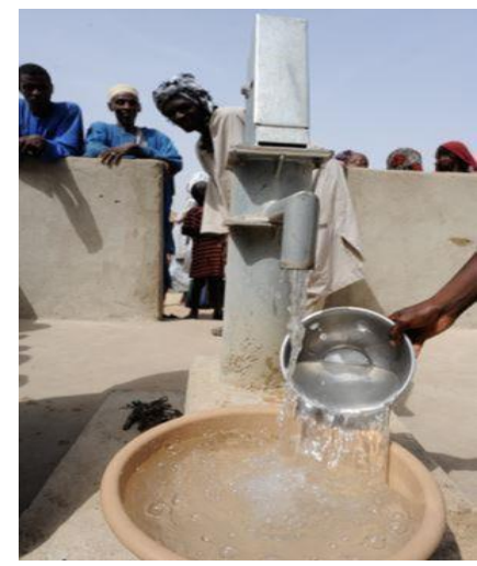
Figure 3 - Well in the Sahel (Source: SOS Sahel, 2014)

Water: The Regional Water Policy (PREAU) joins CILSS, the UEMOA, and ECOWAS. Also adopted in 2008, this attempts to direct ECOWAS and its Member States towards water management that reconciles economic and development, social equity conservation of environment the (A/SA.5/12/08). Its strategic positions are in line with the scope of sustainable development, the UN Framework Convention on Climate Change (UNFCCC), and the African Water Vision 2025 for water, life and the environment defined in 2000 by ECOWAS.