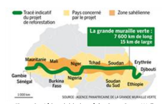
Figure 6 – African initiative of the Great Green Wall

The African Great Green Wall Initiative (AGGWI) was launched in 2007 by Sahel and Sahara States to confront the problems of climate change and other man-made impacts (overgrazing, slash and burn agriculture, brush fires, etc.) which accentuate climate change, as well as desertification and land degradation.