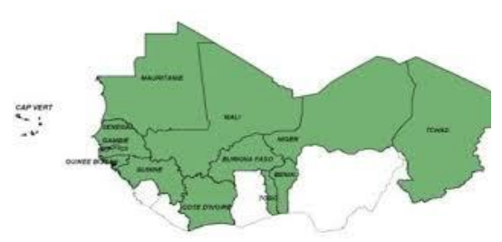
Figure 5 – The 13 member states of CILSS

CILSS was founded in 1973 in response to the drought of the 1970s. It has 5 main missions: