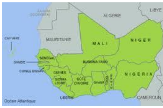
Figure 2 - The 15 Member States of ECOWAS

By adopting supplementary act A/SA.4/12/08 in 2008, the participating Heads of State established ECOWAS Environmental Policy.